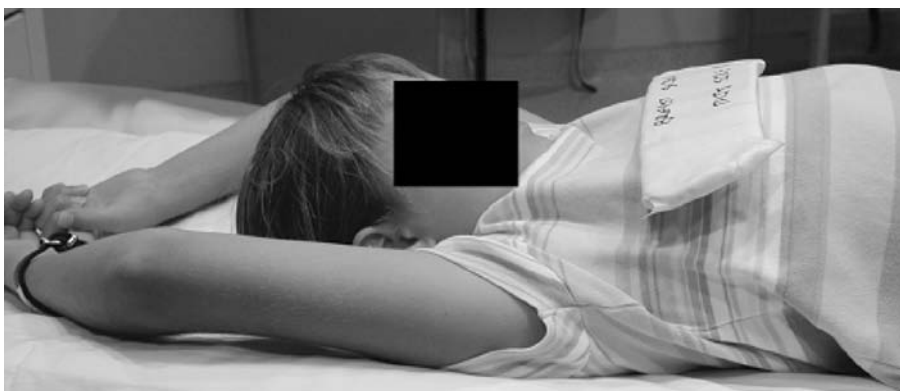
Figure 1 • Patient with breast bismuth shield.

Bismuth shields were purchased in January 2010 and, after staff education, these shields were implemented in the department on February 10, 2010 (Figure 1).