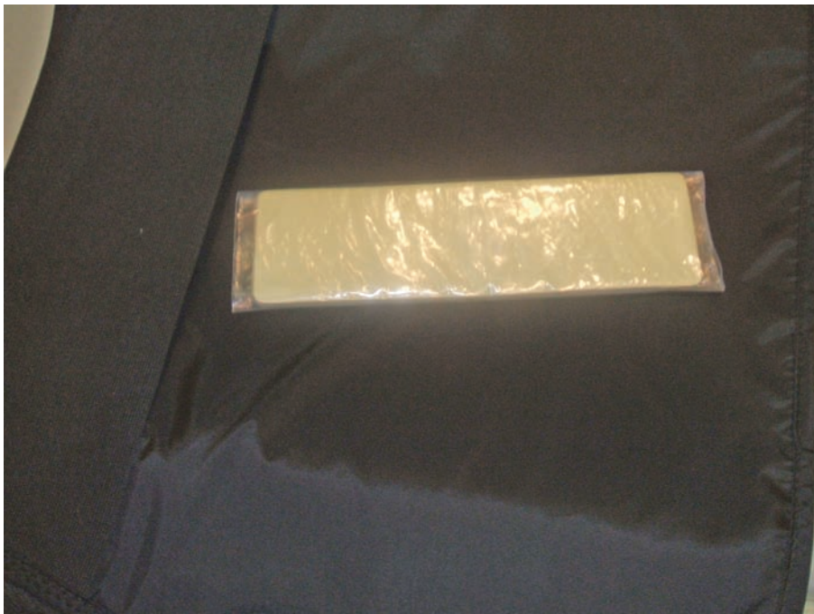
Figure 3 • Bismuth breast shield covered with protective plastic.