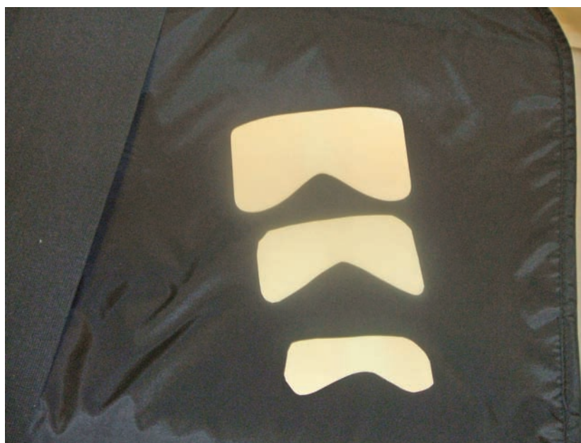
Figure 2 • Bismuth thyroid shields cut to size to accommodate pediatric patients.

modified by staff to fit smaller necks. These modifications were made by cutting down the self-sealing shields with shears (Figure 2). The cost of each shield prohibited the vendor recommended one time use. Therefore, disposable plastic shield covers and plastic Ziploc bags were utilized to cover each shield during use so the shields could be utilized on multiple patients. A new plastic cover was placed on the shield for each patient, thus providing adequate infection control protection (Figure 3).